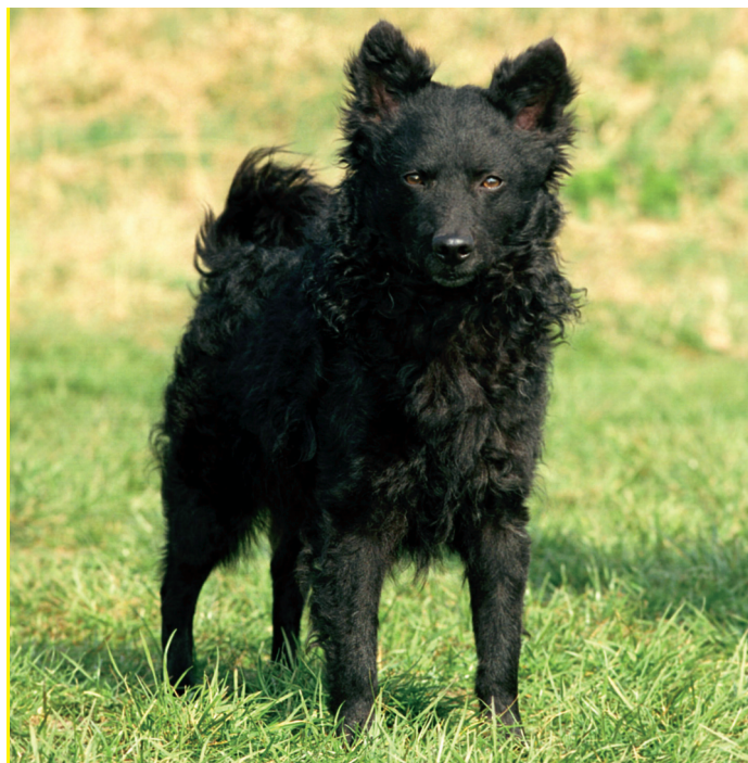
In general, the Mudi gives the impression of a curly-coated small Spitz.

The F.C.I. approved the breed standard in 1966, but very few people were involved in breeding then and this is still the case today. A new standard was written in 2000 and