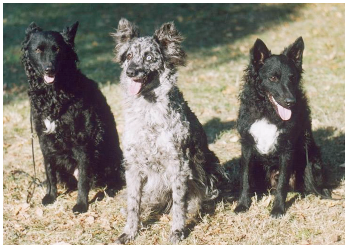
As there were 80 years ago, there are many different types in the Mudi.

Hungarian Breed Club - www.magyardudiklub.freeweb.hu Webring Mudis - www.mudi.hu Mudi Club of America – www.mudi.us Mudi Association of Canada – www.mudi.ca FCI breed standard – www.fci.be