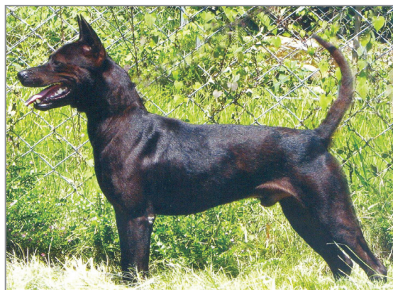
Breeders know that they work with a piece of cultural heritage that has to be protected.