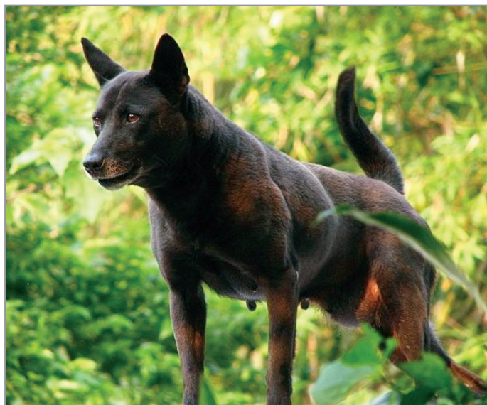
The Taiwan Dog's practical value is now as a hunting dog, watchdog and companion dog.

In 1987, I travelled to the Far East and visited Taiwan. I wrote in my travel journal: When crossing the streets in Taipei, a city with millions of people, cars and motorbikes, I prefer to walk very close behind an old Chinese man or woman. There are many and they survive the dangerous crossings. Taxi drivers are driving as though they were mad, and they love it when they see that I'm not afraid. 'No problem, don't worry miss,' they say. 'Only first class drivers in Taipei. Second class all dead.'