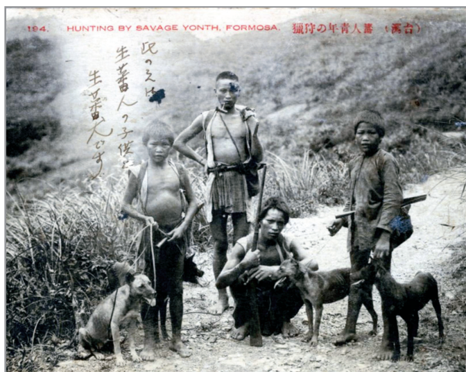
"Savage yonth" should be "aboriginal youth." In this period name of the breed was Formosan (Mountain) Dog. The dog on the left has a German Shepherd expression.

Taiwan has over 23 million inhabitants; about 98 percent are Han Chinese and the rest are divided among more than 50 tribes. The official language is Mandarin; the country has freedom of religion.