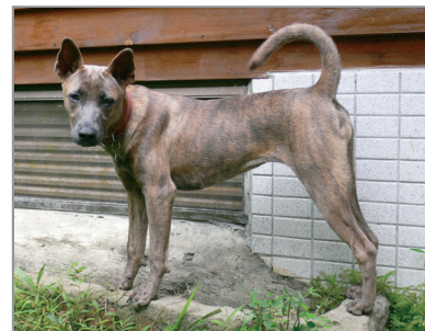
The Taiwan Dog comes in many colors. This brindle-coated dog is six months old.

Breeders know that they work with a piece of cultural heritage that has to be protected. Appearance and temperament should go hand in hand; the Taiwan Dog's practical value is now as a hunting dog, watchdog and companion dog.