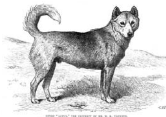
From Cassell, The Book of the Dog (1881).

The Australian National Kennel Council is a member of the Fédération Cynologique Internationale (FCI), but the influence of Great Britain, thanks to an alliance for centuries with this country, is noticeable everywhere. More information about the ANKC and breed-registration numbers can be found at: www.ankc.aust.com .