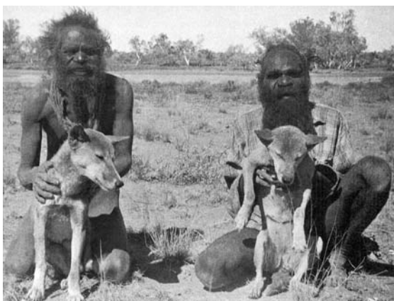
(Top) An Aborigine and his Dingoes (that may carry some Greyhound blood). (Above) Pintubi tribesmen with Dingoes.