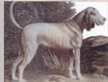
Old engraving of a Talbot, unfortunately without a date or signature.