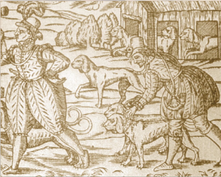
The hunting dogs in this engraving appear to be Talbots.

The Talbot was also used to track cattle thieves and escaped prisoners and therefore contributed to law enforcement. The breed's excellent nose and tracking ability also made him a valued hunting dog, tracking the game and finding the wounded or dead game after it had been shot. In various European countries, the Talbot was owned exclusively by the aristocracy and those wealthy enough to buy, own and feed this valuable dog.