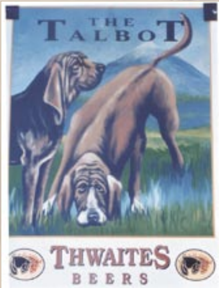
Inn sign of hotel "The Talbot" in Ambleside (Lake District, England). It shows two Talbots of the right type, a brown one and a black-and-tan.