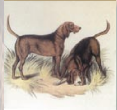
Two Bloodhounds depicted in "Cynographia Britannica" by Sydenham T. Edward (around 1800).

But what about the old English automobile, also named Talbot? The first Talbot motor car left the factory in 1904. On the bonnet was a small model of a dog with long ears. It derived from the family name and coat of arms of the owner of the car factory: the Earl of Shrewsbury!