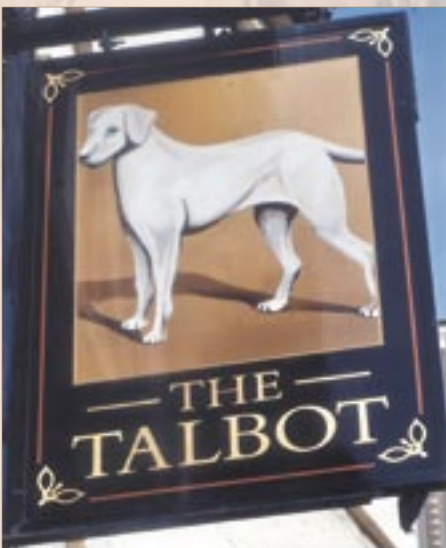
"The Talbot" is a pub in the centre of Richmond (Yorkshire, England). This sign shows the original white colour, but the dog has not the typical long and pendulous ears.

1968: "Although difficult to breed to show criteria, the English White was a distinctive breed and one easy to recreate." I believe the recreation of this breed has never happened because at the end of the 19th Century, the Bull Terrier and Fox Terrier developed rather quickly into popular breeds for the show ring.