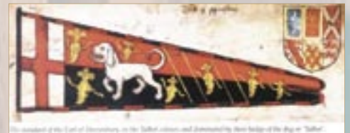
The standard of Georg Talbot, the sixth Earl of Shrewsbury (1522-1590). This standard is exactly the same as the logo of the Talbot motorcar in the 20th Century